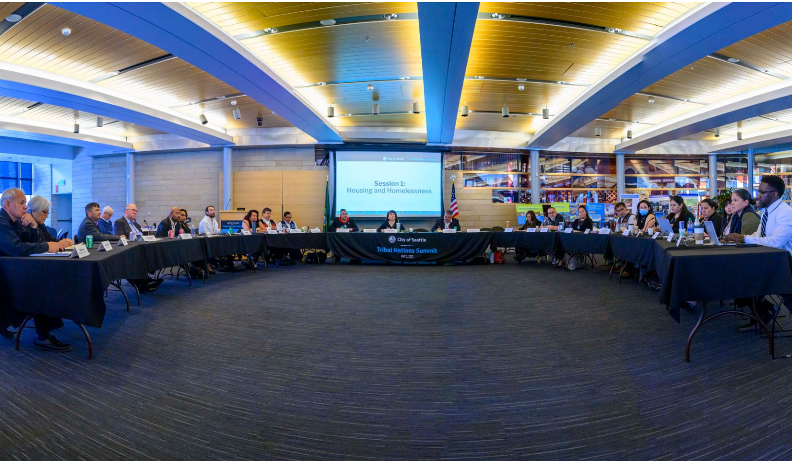
Leaders gathered at the table to discuss top issues impacting Tribal and urban Native communities.

"We are intentional about developing government-to-government relationships. It's going to be based on meaningful and consistent engagement and constructive dialogue centered on the priorities that you are telling us need to be made. We want to provide opportunities for our city officials, our staff, and our residents to learn from the Native people of this land. We want to amplify the voices, experiences, priorities, and histories of the Indigenous peoples of this land."